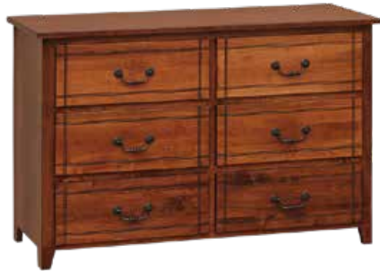
#107 MA • 6-Drawer Changing Dresser 50¼" w x 20" d x 33¼" h