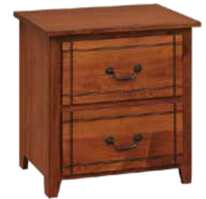
#112 MA • 2-Drawer Nightstand 24½" w x 18" d x 25½" h