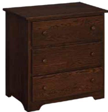
#111 SH • 3-Drawer Chest 34" w x 20" d x 33¼" h