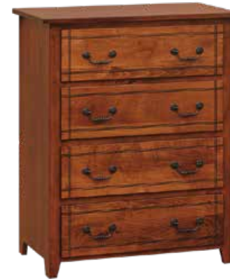
#110 MA • 4-Drawer Chest 34" w x 20" d x 42½" h