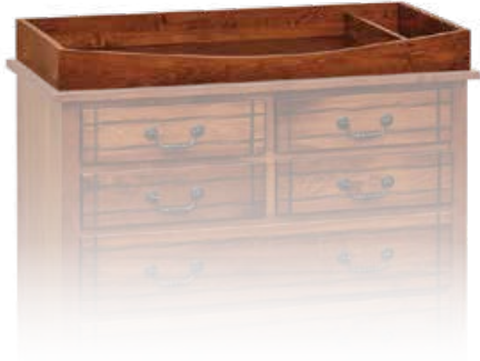
#113 • 42" Removable Changing Station Fits item #106 or #115