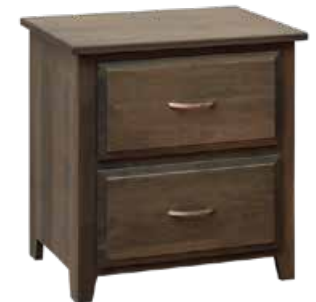
#112 HA • 2-Drawer Nightstand 24½" w x 18" d x 25½" h