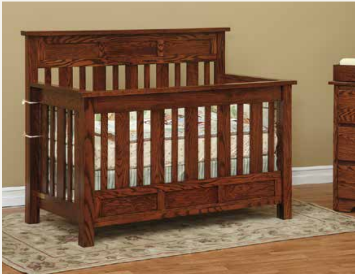
#301 • Crib 58½"w x 31¼"d x 46¼"h