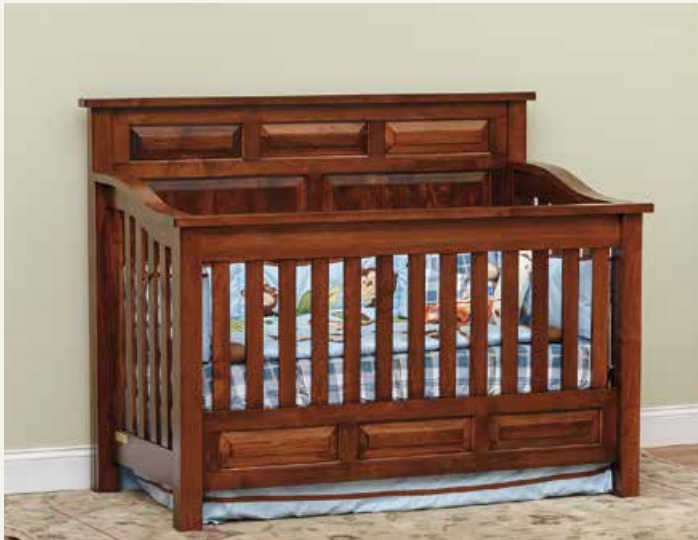
#401 • Crib 58½"w x 31¼"d x 46¼"h