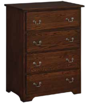
#110 SH • 4-Drawer Chest 34" w x 20" d x 42½" h