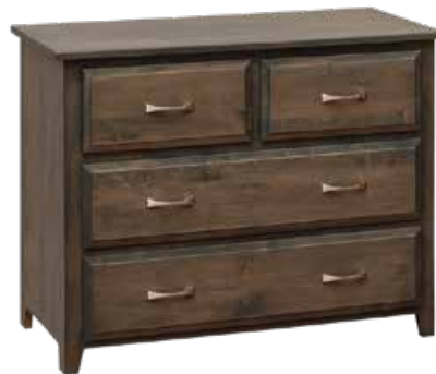
#115 HA • Changing Dresser 42" w x 20" d x 33¼" h