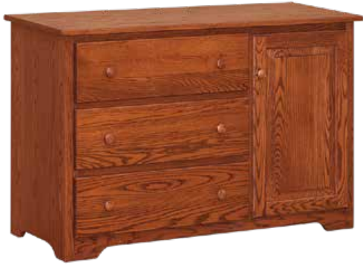
#105 SH • Changing Dresser 50¼" w x 20" d x 33¼" h