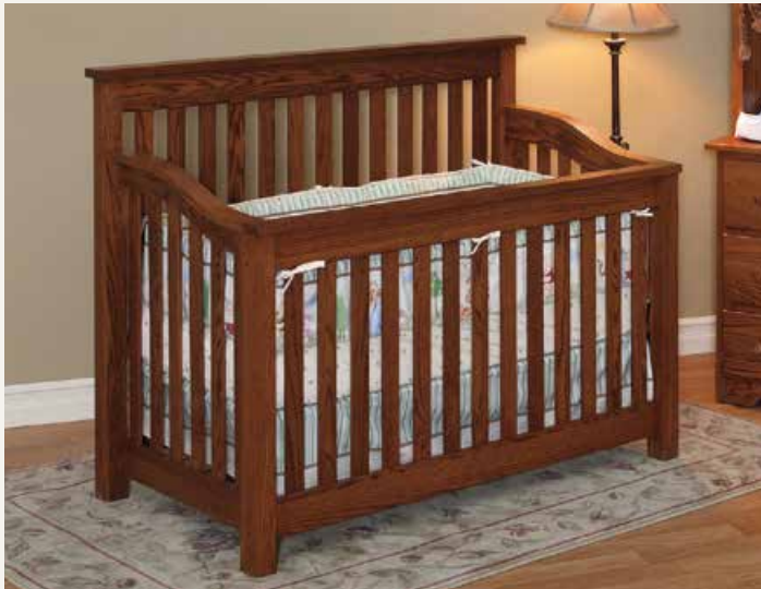
#101 • Crib 58½"w x 31¼"d x 46¼"h