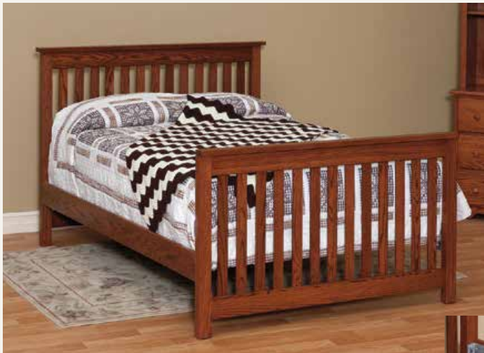
#103 • Full Sized Bed Conversion Kit Includes bed rails, slats, and hardware to easily convert crib into a full sized bed.