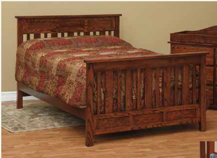
#103 • Full Sized Bed Conversion Kit Includes bed rails, slats, and hardware to easily convert crib into a full sized bed.