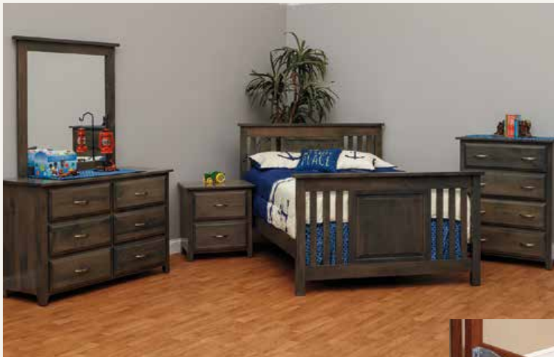
#103 • Full Sized Bed Conversion Kit Includes bed rails, slats, and hardware to easily convert crib into a full sized bed.