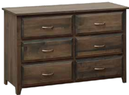
#107 HA • 6-Drawer Changing Dresser 50" w x 20" d x 33¼" h