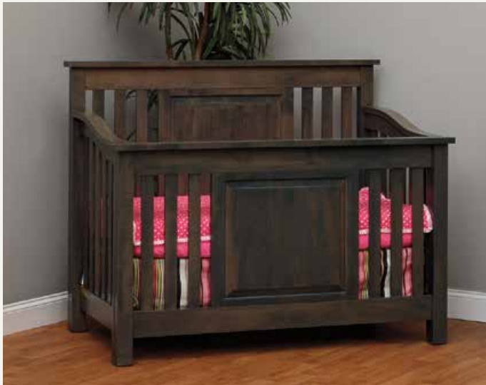
#501 • Crib 58½"w x 31¼"d x 46¼"h