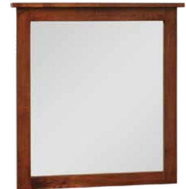
#114 • Mirror 39"w x 40 \frac{1}{2} "h