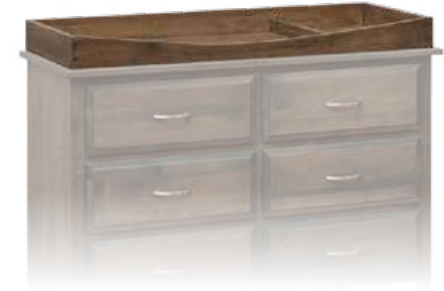
#117 • 50" Removable Changing Station Fits item #105 or #107