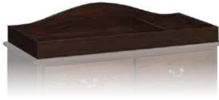
#108 • 50" Removable Changing Station Fits items #105 or #107