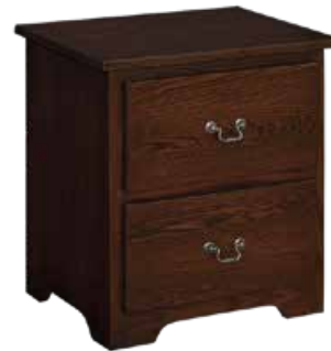
#112 SH • 2-Drawer Nightstand 24½" w x 18" d x 25½" h