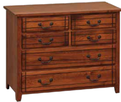
#106 MA • Changing Dresser 42" w x 20" d x 33¼" h