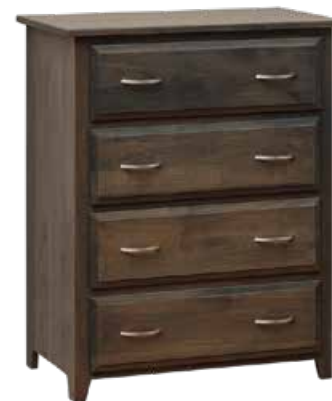
#110 HA • 4-Drawer Chest 34" w x 20" d x 42½" h