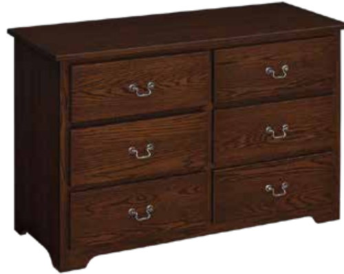
#107 SH • 6-Drawer Changing Dresser 50¼" w x 20" d x 33¼" h