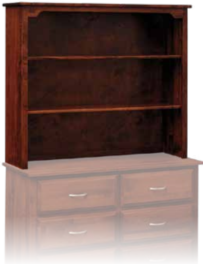
#109 • Hutch Top Fits item #105 or #107 50 \frac{1}{4} " x 14"d x 42 \frac{3}{4} "h