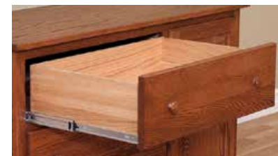
Full Extension Slides and Dovetail Drawers!