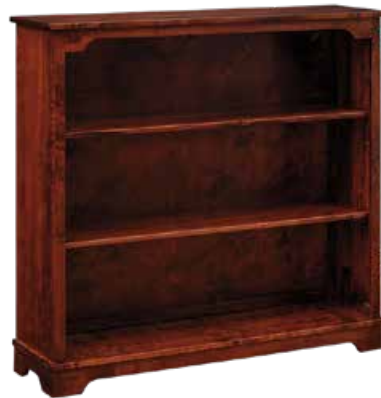
#116SH • Hutch Top with Base Fits item #105 or #107 Also available as Madison or Hartford 50 \frac{1}{4} " x 14"d x 46 \frac{3}{4} "h

Base is removable to convert from bookcase to hutch top