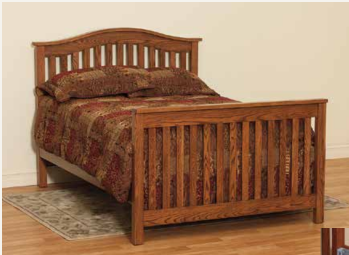
#103 • Full Sized Bed Conversion Kit Includes bed rails, slats, and hardware to easily convert crib into a full sized bed.