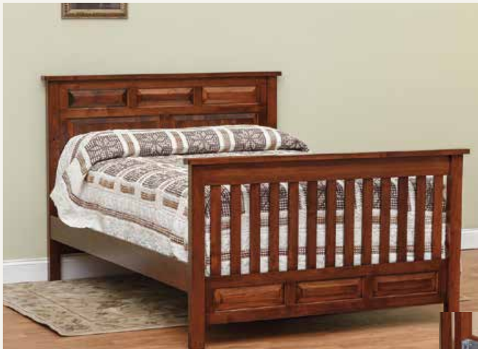
#103 • Full Sized Bed Conversion Kit Includes bed rails, slats, and hardware to easily convert crib into a full sized bed.