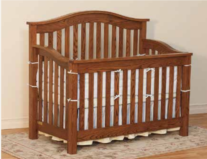
#201 • Crib 58½"w x 31¼"d x 50½"h